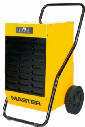
DH 44 DH 62 DH 92