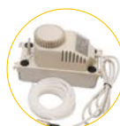
Water pump Forcing height 4m 4512.441