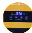
Digital control panel